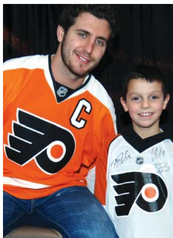
Flyers captain Mike Richards poses with fan at Carnival.

More than 7,000 fans packed the Wachovia Center for the 33rd Flyers Wives Fight for Lives Carnival (January 10). As Comcast-Spectacor Foundation's largest fundraising event, the Carnival has raised and donated nearly $23 million back into the community over the past 33 years. The money raised benefits local non-profit organizations with a focus on local youth and important healthcare initiatives. Past beneficiaries include, but are not limited to, Arthur Ashe Youth Tennis & Education Center, Ed Snider Youth Hockey Foundation, YMCA, Philadelphia Youth Network, Firefly Literacy Fund, Virtua Foundation, Penn Hospice at Rittenhouse, Foundation for Melanoma Research, and Living Beyond Breast Cancer.